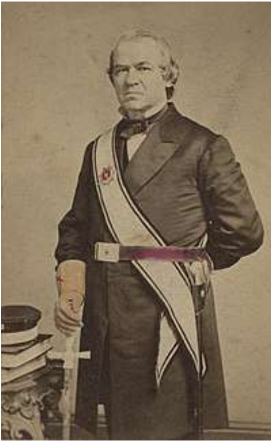
President Andrew Johnson in Knights Templar uniform (1869)