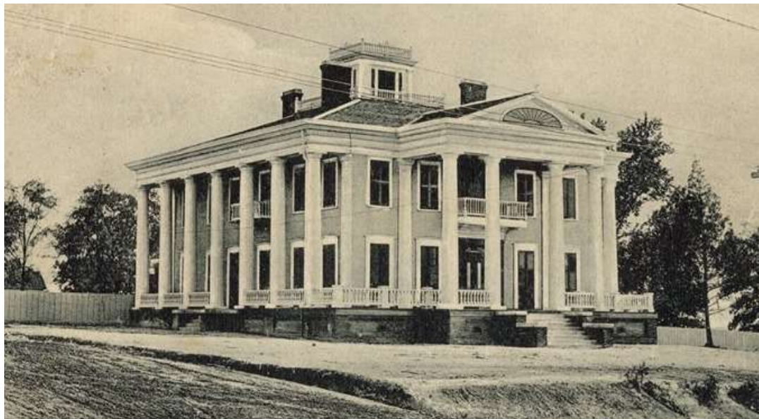
The Wynn House, 1908. Postcard from the Columbus Museum.