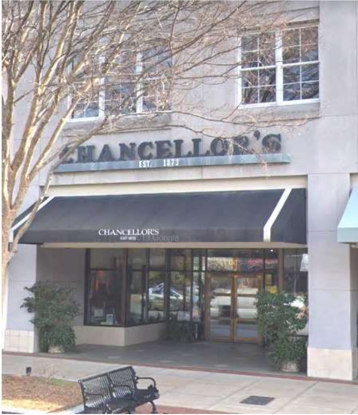
Photo from Google maps...