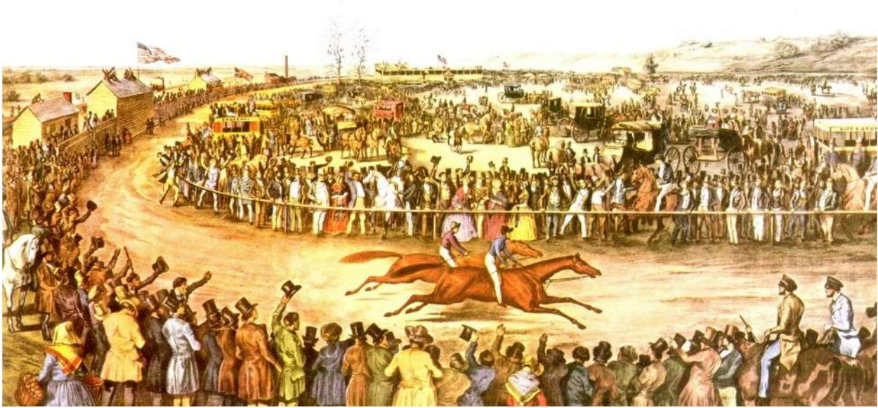
This is a Currier and Ives print of the 1845 North-South race between Fashion (North) and Peytona (South). Peytona won. The race was held at Union Course.