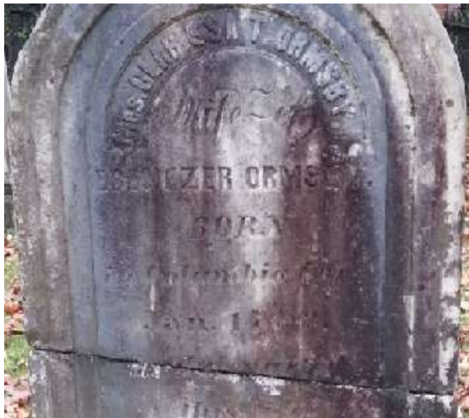
Clarissa's tombstone in the Pratt Family Cemetery