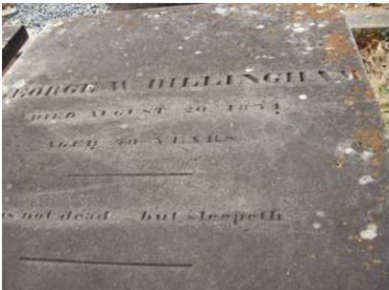
Dillingham's grave in Linwood