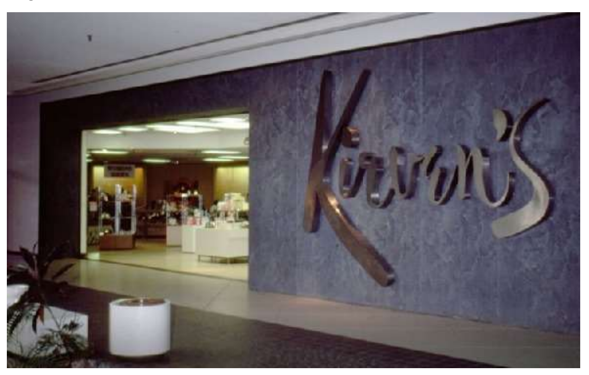
Photofrom Andy Funderburk's photos @ <a href="https://www.facebook.com/pg/ColumbusSquareMall/about/?ref=page">https://www.facebook.com/pg/ColumbusSquareMall/about/?ref=page</a> internal

Also check out a good piece on Columbus Square Mall at <a href="http://skycity2.blogspot.com/.../columbus-square-mall-02...">http://skycity2.blogspot.com/.../columbus-square-mall-02...</a>