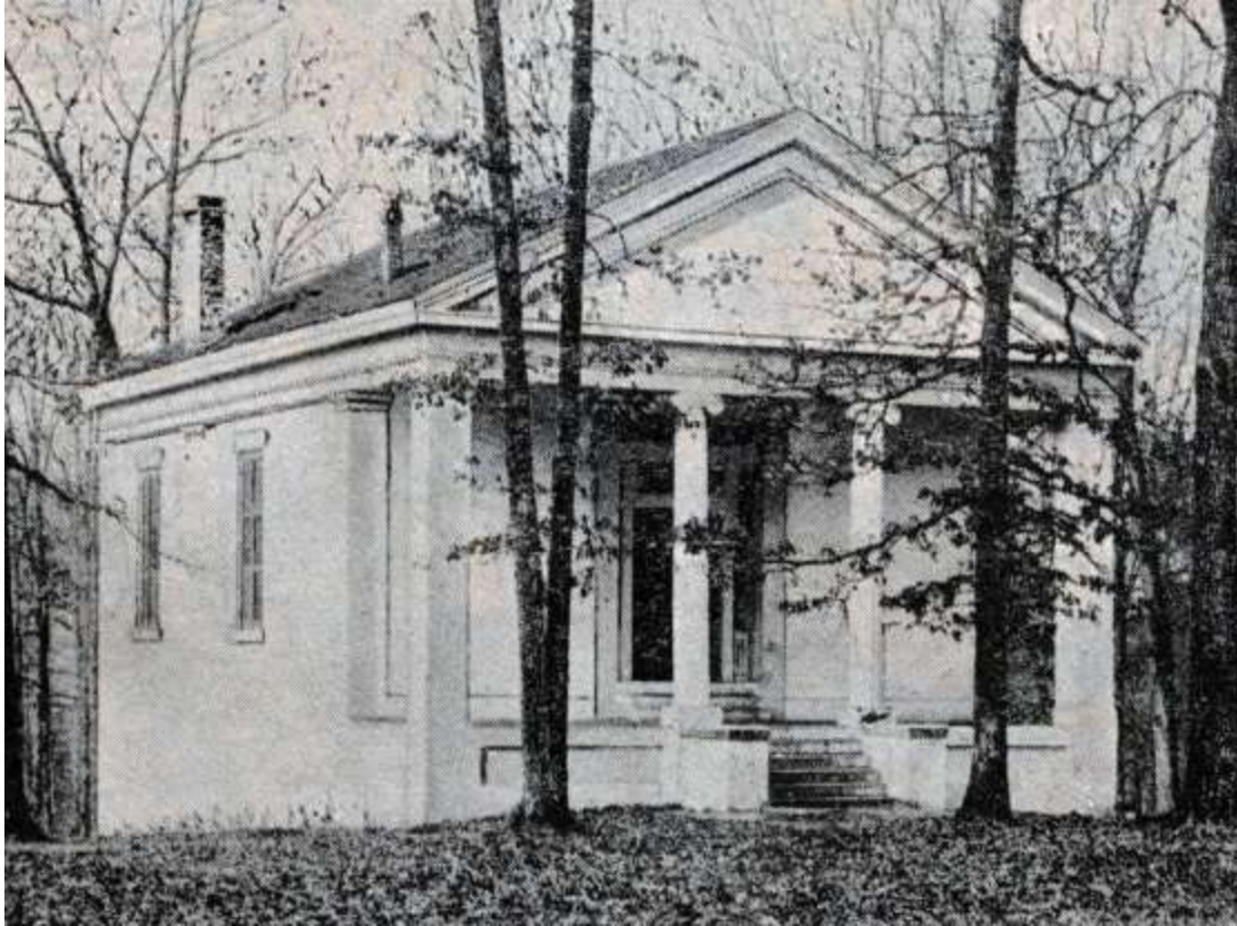
Emory College Debate Hall, built early 1850s;restored 2018.