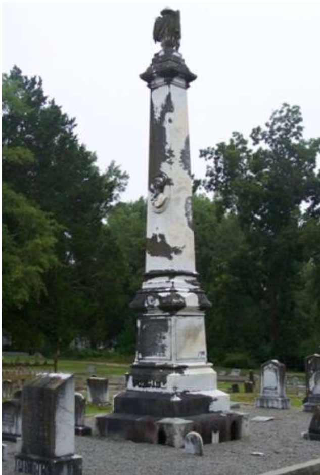
Pierce's monument in Sparta Cemetery.