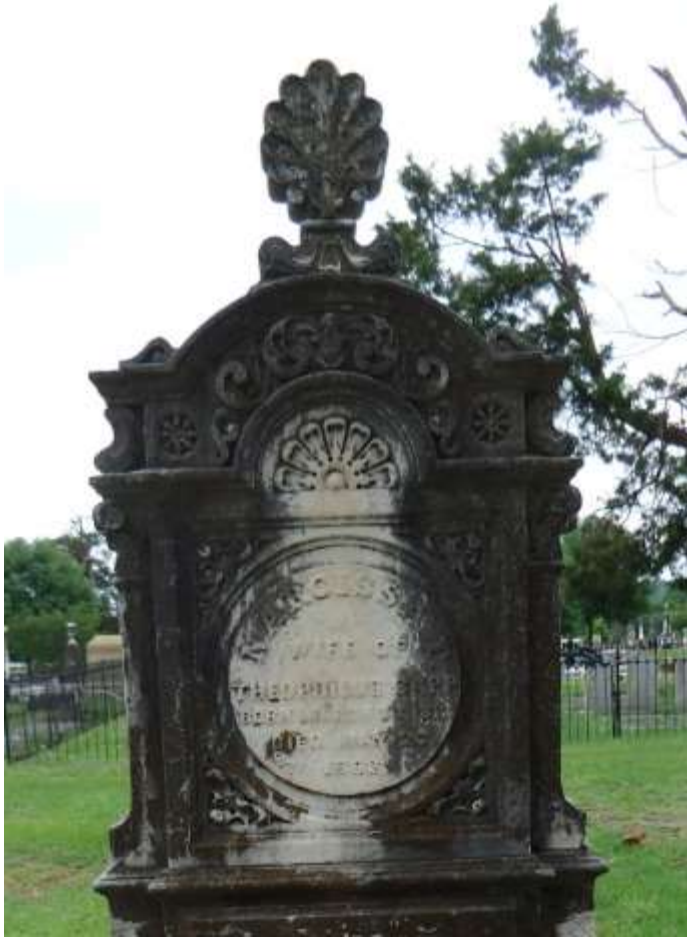
Narcissa's monument in Linwood Cemetery.